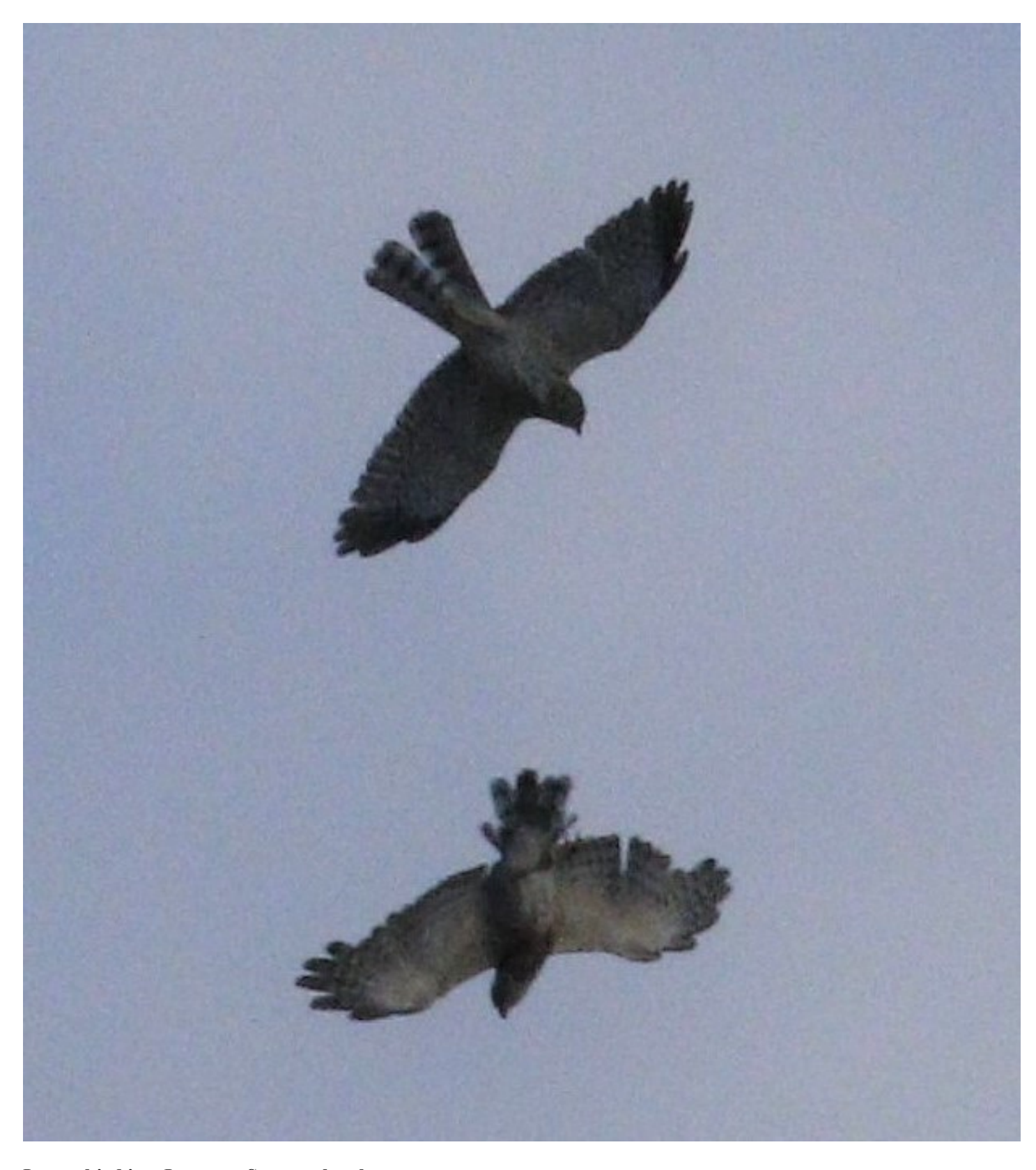
Lower bird is a Japanese Sparrowhawk