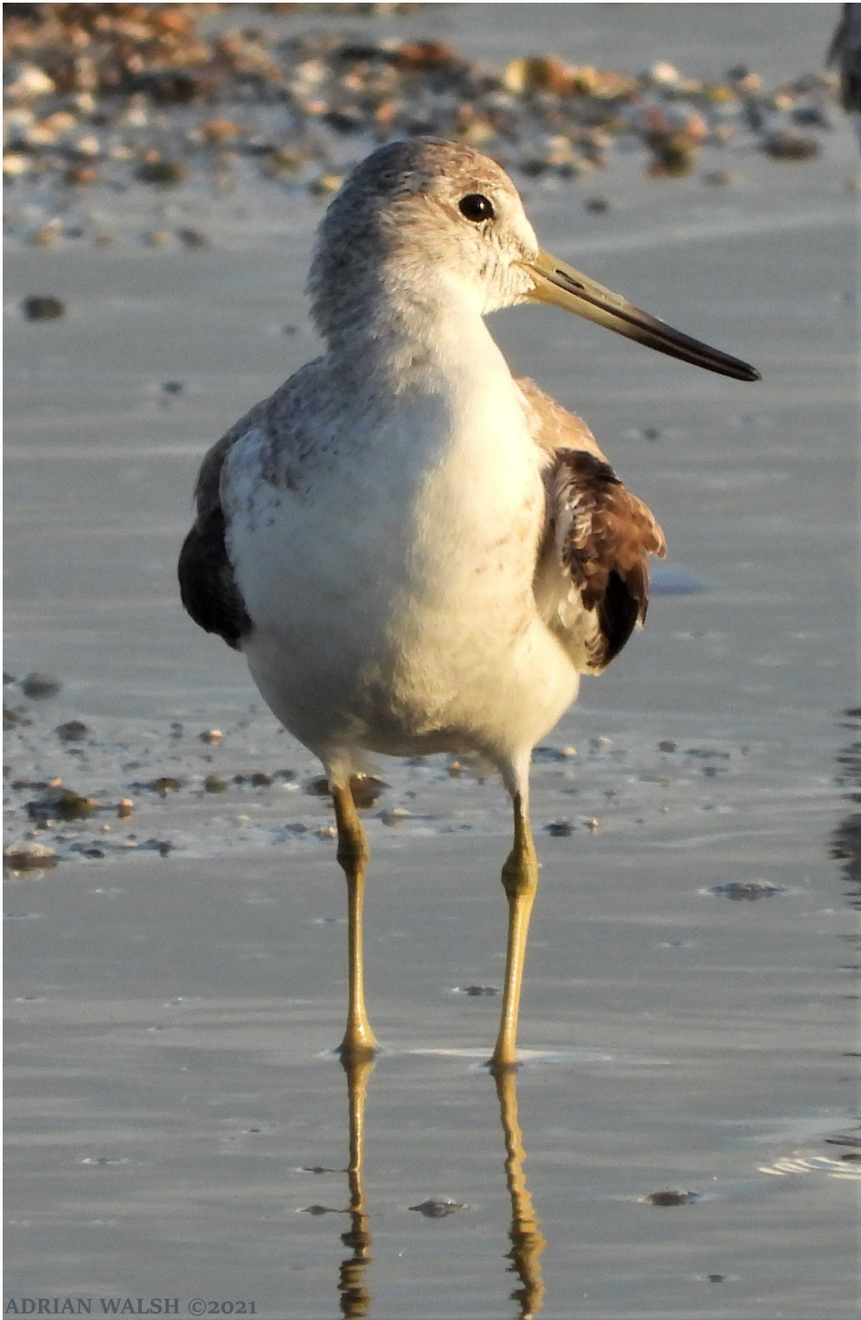
ADRIAN WALSH ©2021