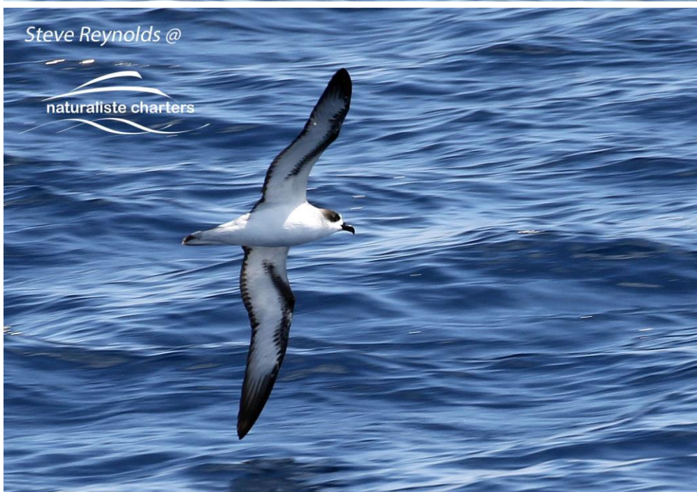
Bremer Canyon, WA, 24 th January 2021