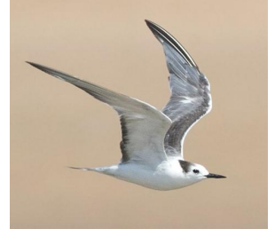
Fig 5: 2 Feb 2020 (David Irving)