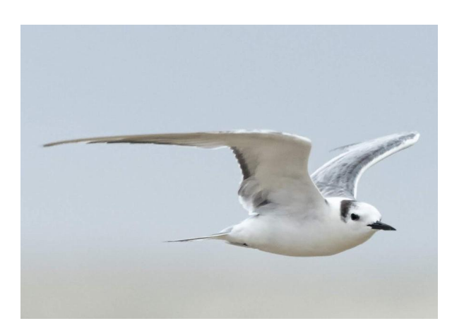
Fig 3: 11 Jan 2020