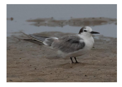
Fig 4: 19 Jan 2020 (Jodi Webber)