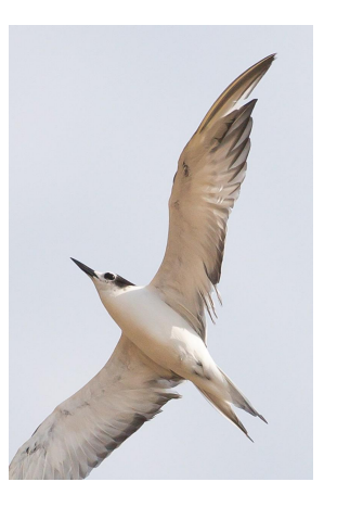
Fig 2: 7 Jan 2020 (Stephanie Owen)