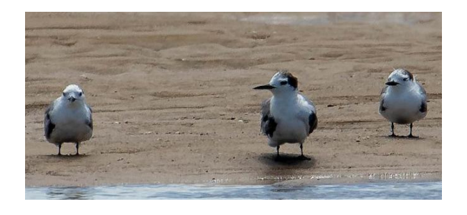
Fig 6: 20 Feb 2020 (Louis Blackman)