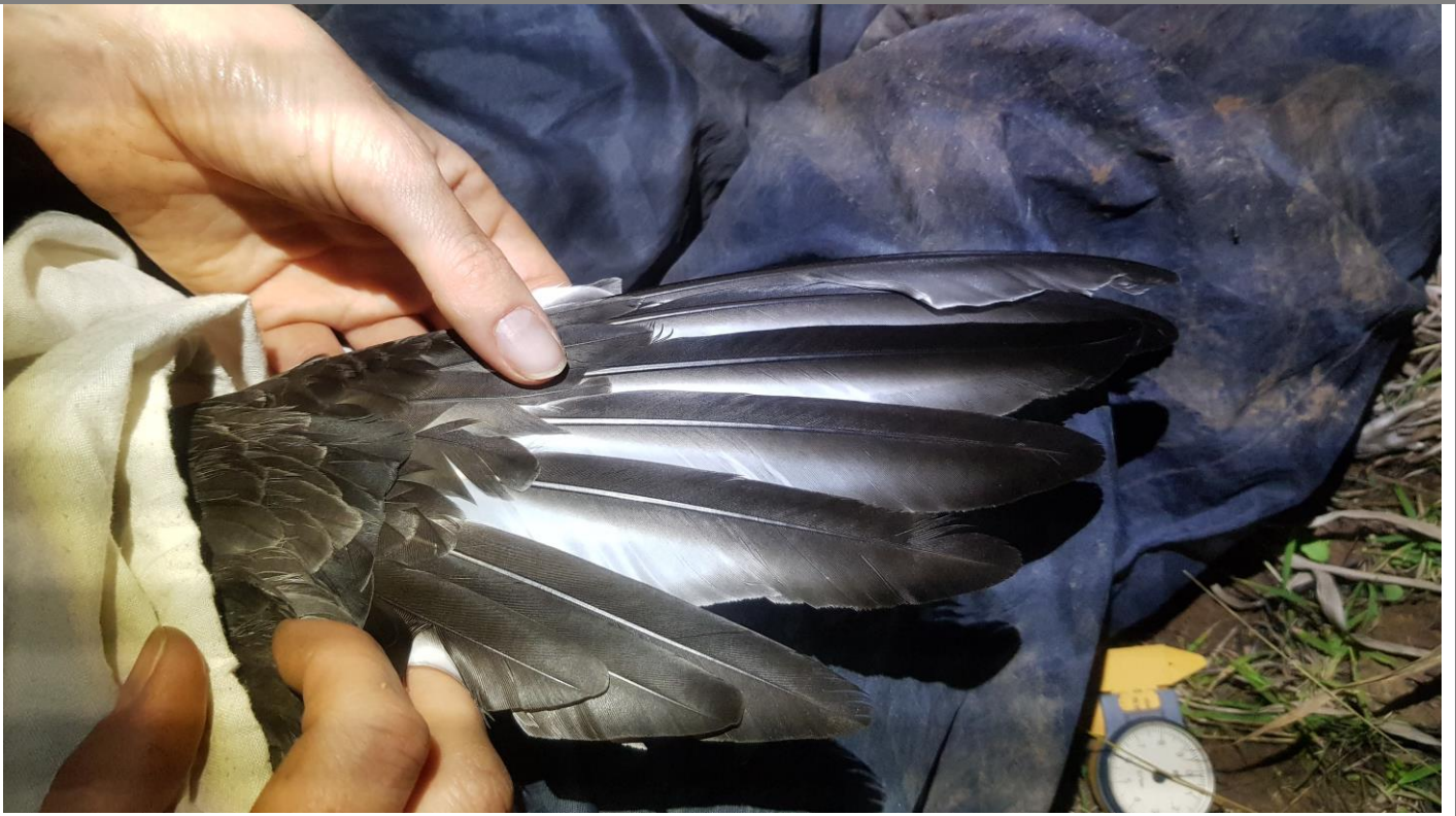
Primary shafts appear light due to head lamp lighting affecting photograph. Primary shafts were black.