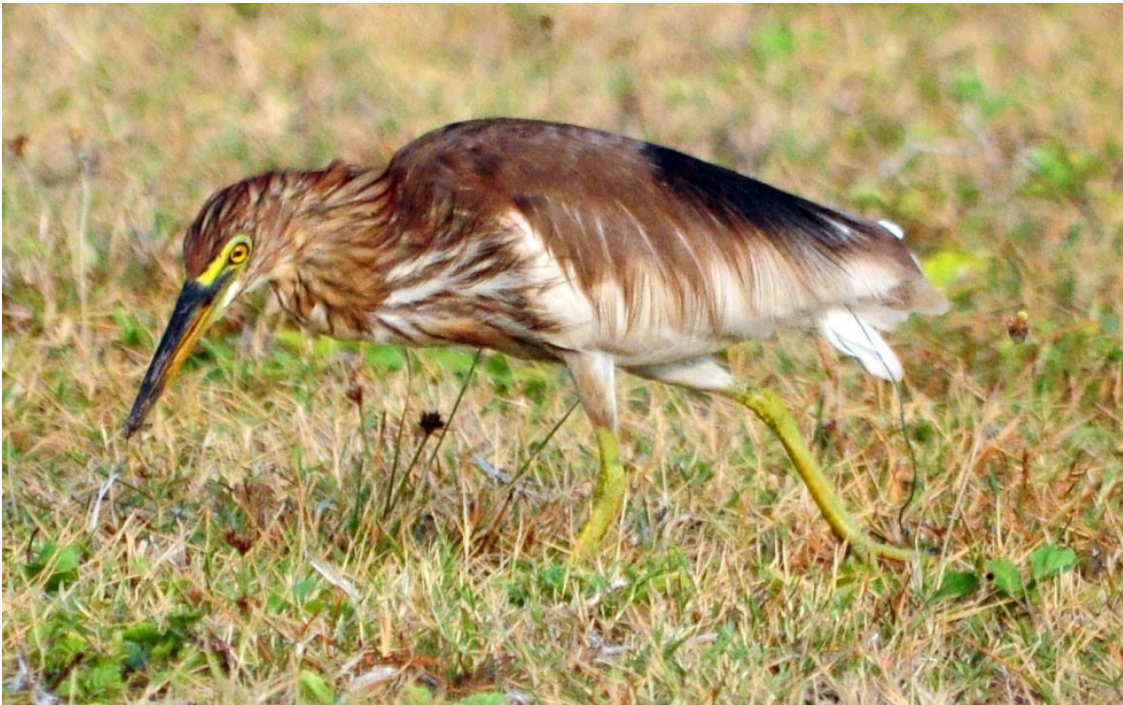
Chinese Pond Heron Cocos 30 th October 2015

A character of Chinese Pond Heron not exhibited in Javan Pond Heron noticed by Geof Christie (not yet universally accepted as a reliably diagnostic) that can also show in birds not showing breeding plumage is illustrated below.