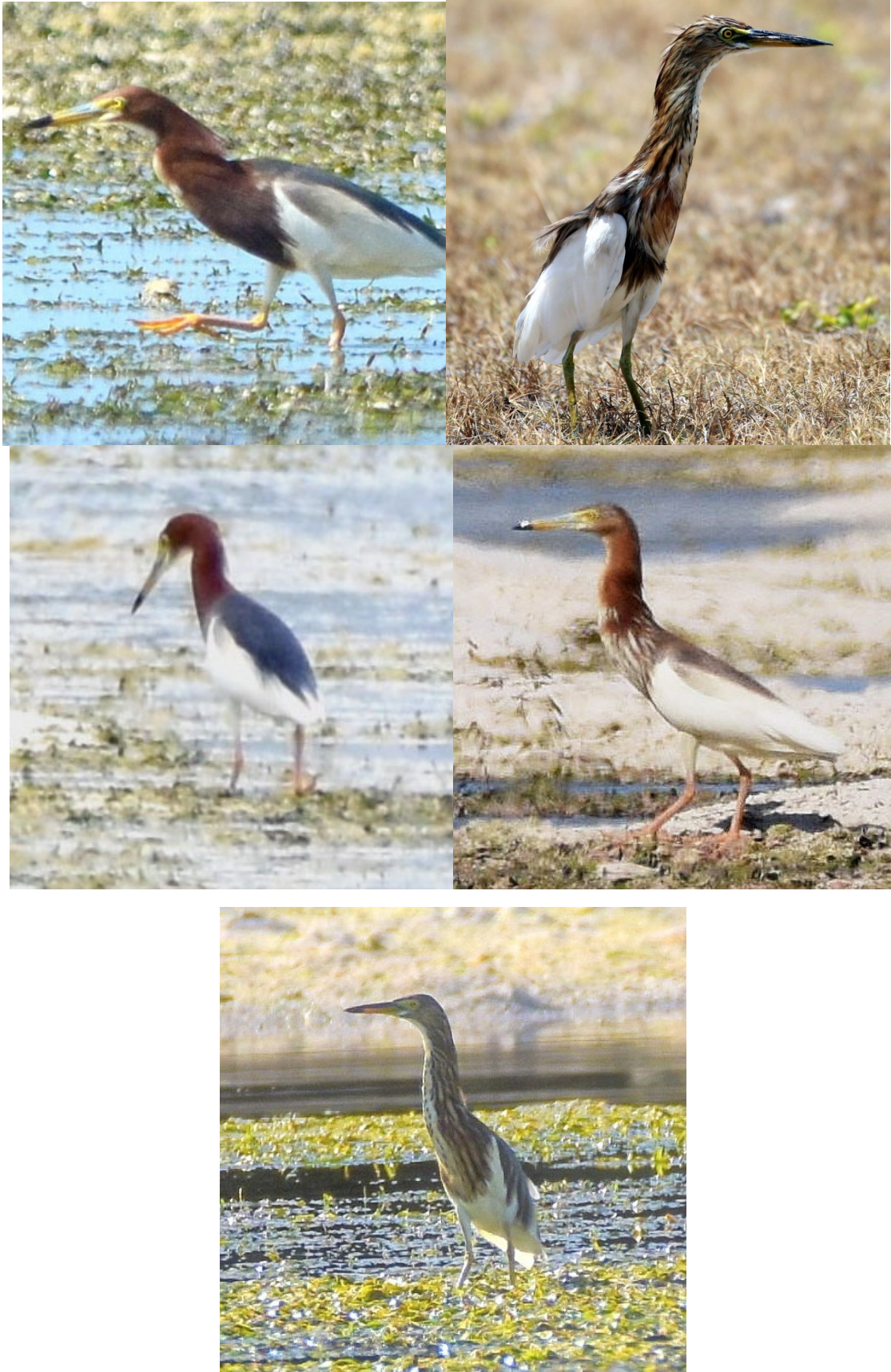
Bird 2 at Pulu Ampang left to right & top to bottom Fig. 6, 17 th January 2015; Fig. 7, 5 th December 2015; Fig. 8, 14 th December 2016; Fig. 9, 21 st December 2018; Fig. 10, 27 th March 2018.