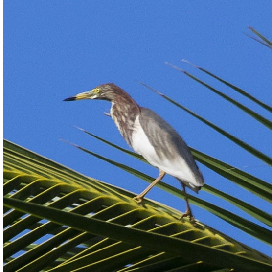
Fig. 3. West Is. 21 st May 2014

BIRD 2. 2014 to 2020. Mostly at Pulu Ampang but first seen on West Island.