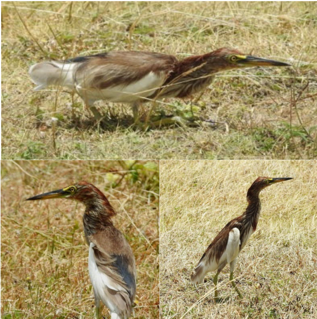
Figs. 14, 15 & 16. West Island airstrip, 11 th October 2015

BIRD 4. From September 2015 to January 2016 on West Island concurrent with Birds 2 & 3. Seen intermittently by Geof Christie