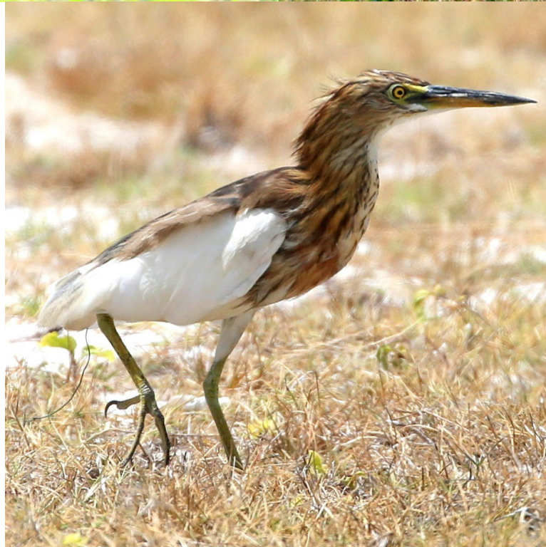
West Island airstrip, 2015. Fig. 11, 23 rd June & Fig. 12, 30 th October. Note broken iris in left eye.. Fig. 13, 5 th December. Note thread emanating from anus.