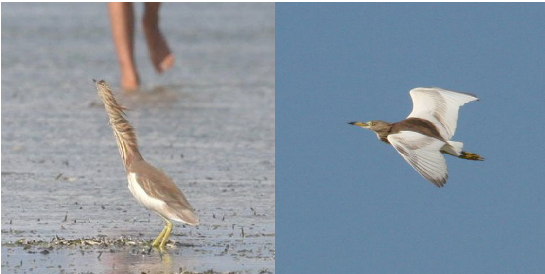
Figs. 1 & 2. West Island 24 th March 2011