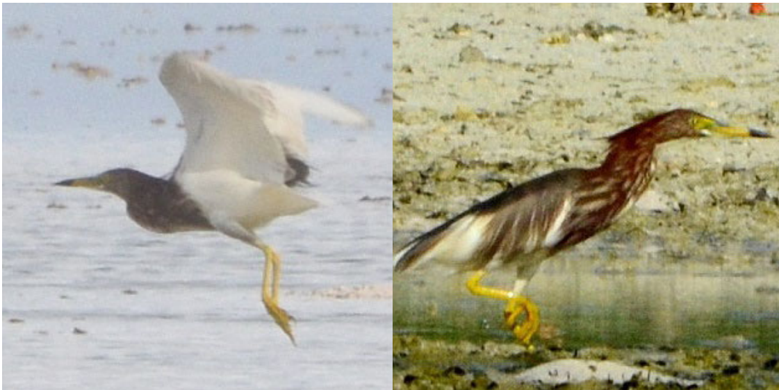
Figs. 4 & 5 Home Island & Pulu Ampang: left on 5 th June, right 15 th June 2014

This bird was showing much breeding plumage (Fig. 3) when first seen on West Island on 21 st May 2014 by Geof Christie, Pam Jones and Karen Willshaw. It relocated almost immediately to Home Island and then took up residence on the reefs at the south-eastern tip of Home Island and those that surround adjacent Pulu Ampang. It remained there until at least January 2020 (six years) and there is no reason to suspect that it isn't still present. Although it is thought to have moulted in and out of breeding plumage, that sequence seemed to be independent of season. For instance it was in breeding plumage in May/June 2014, as well as six months later in January 2015 and again in December 2016. It was in non-breeding plumage in February 2018. Whenever looked-for it could normally be found near Pulu Ampang, only missed on rare occasions. This individual was timid and retiring. Other identifiable images of this bird are below and for interest, the last, Fig.10, is of this bird in non-breeding plumage.