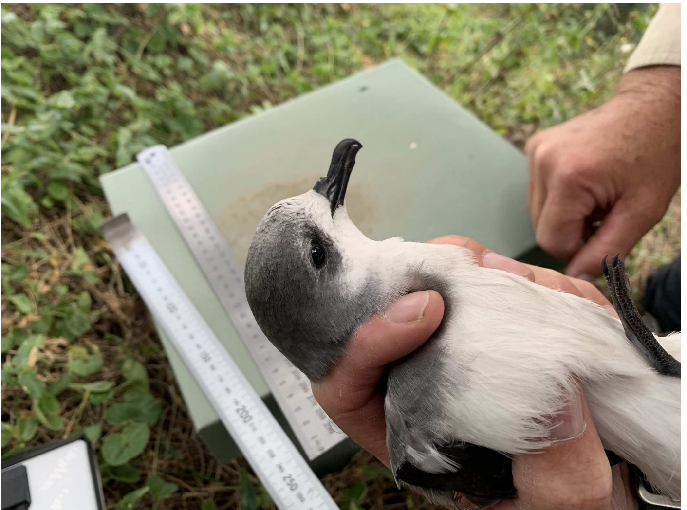
Figure 2. Pycroft's Petrel, Broughton Island, 26 Oct 2019