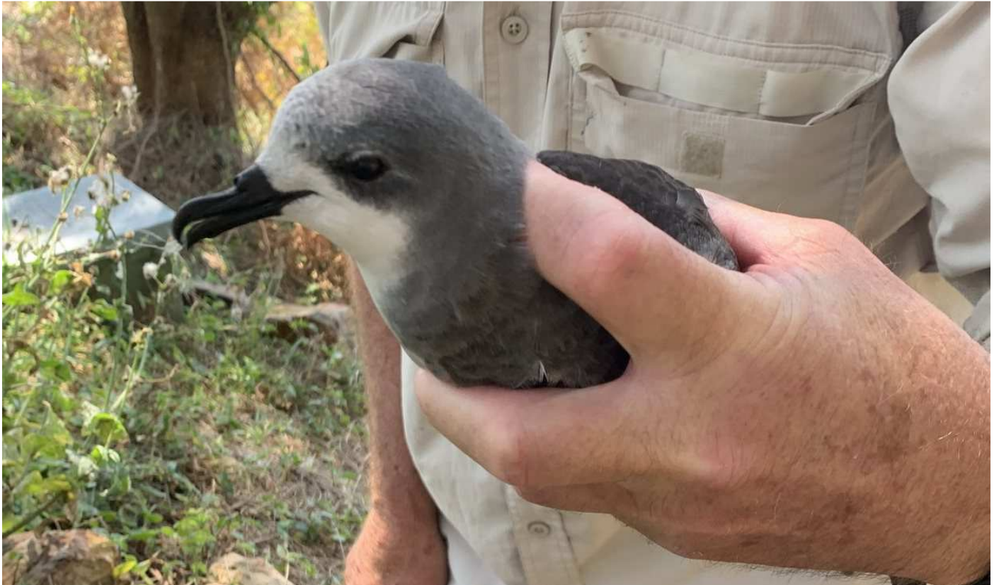
Figure 1. Pycroft's Petrel, Broughton Island, 25 Oct 2019