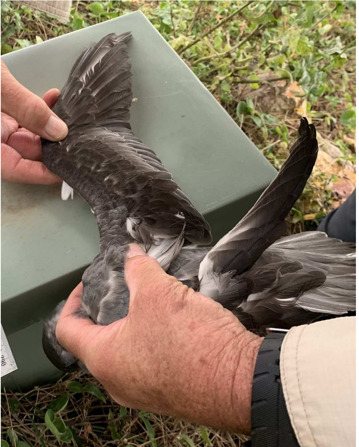
Figure 3. Pycroft's Petrel, Broughton Island, 26 Oct 2019