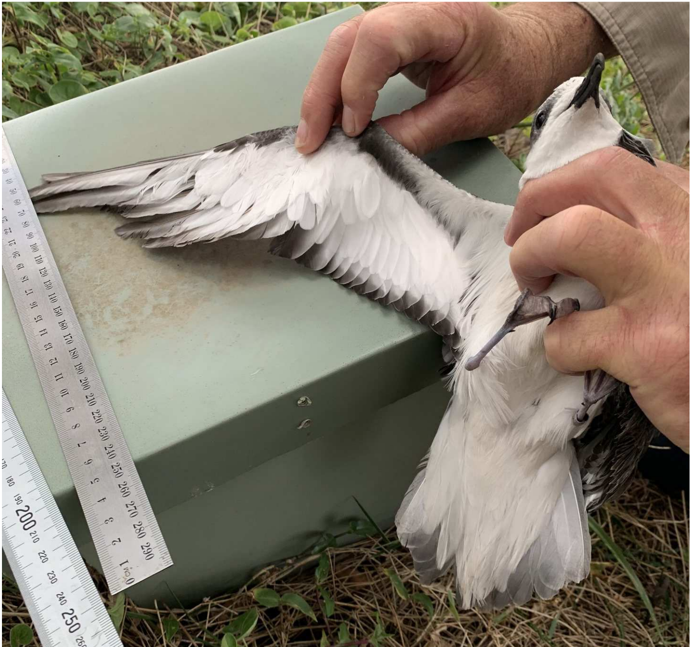
Figure 4. Pycroft's Petrel, Broughton Island, 26 Oct 2019