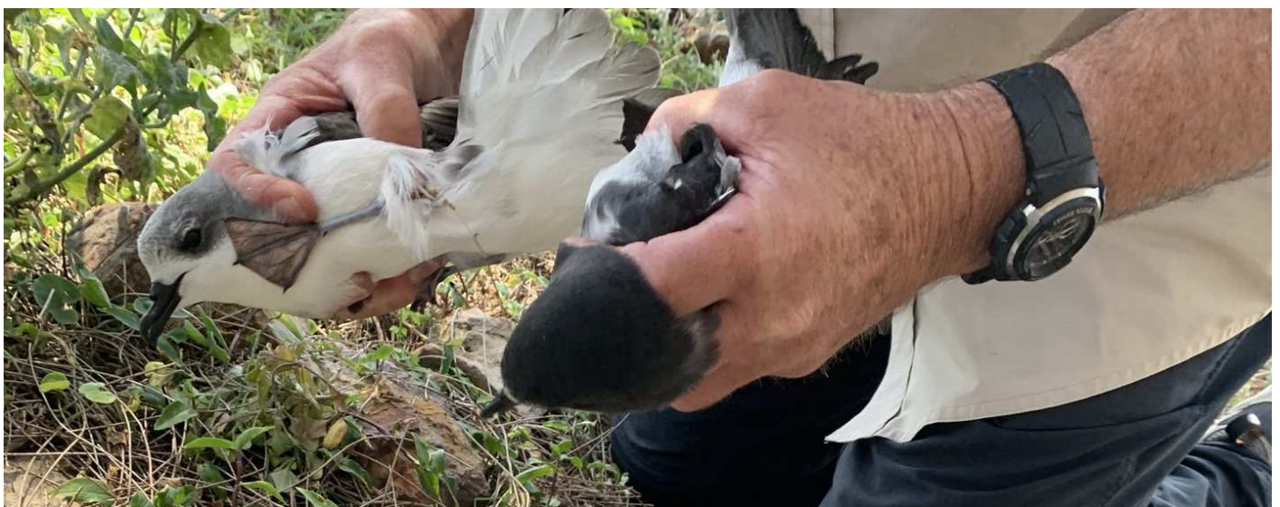
Figure 5. Pycroft's Petrel and Gould's Petrel, Broughton Island, 25 Oct 2019