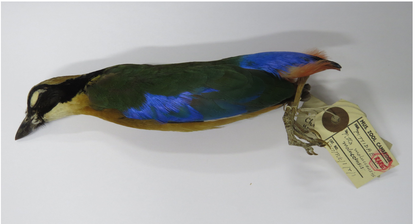
Figure 3. Side view of specimen.