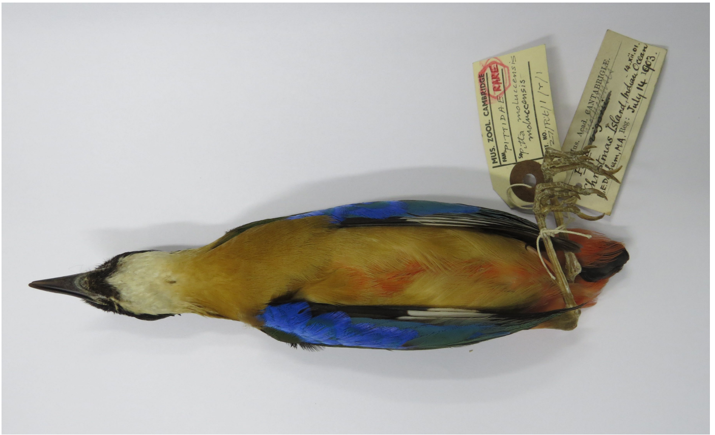
Figure 1. ventral view of specimen