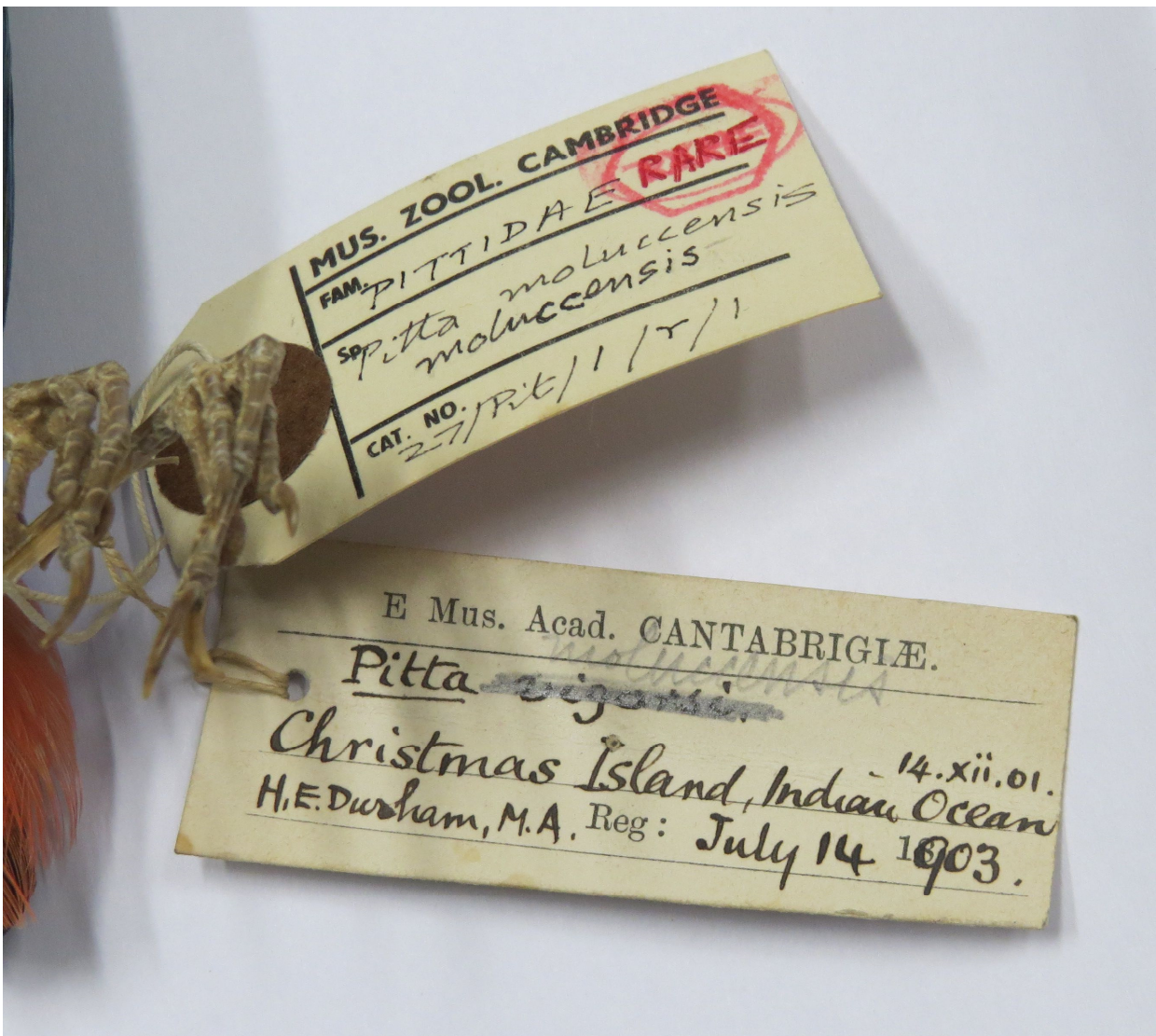
Figure 4. Specimen labels.